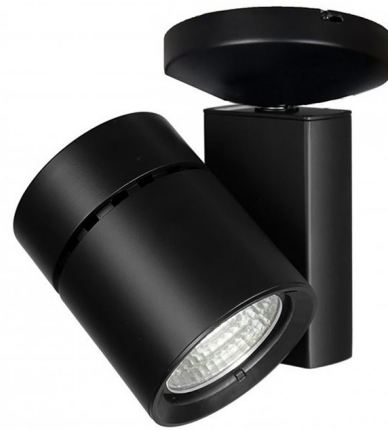
Shown in black / clear