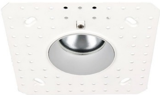
Shown in: Haze

Aether 2 Inch Round Trimless (invisible) Downlight was designed to fit in tight plenum spaces with complex HVAC ducts, sprinkler pipes, and conduit runs. Die-cast aluminum trim with extruded aluminum heat sink. Available in Brushed Nickel, White, Haze or Black. Dimmable to 0% with 0-10V dimmers (120 & 277V) or to 10% with low-voltage electronic dimmers (120V only). Choice of 85 or 90 CRI; 2700K, 3000K, 3500K, or 4000K color temperature; and 17 degree (spot), 24 degree (narrow flood), 40 degree (flood), or 50 degree (wide flood) beam angle. 35 degree cutoff angle for downlight. 2 inch trim aperture and housing height. Accommodates ceiling thickness of 0.5-1 inch. 5 year WAC Lighting warranty. UL listed for wet locations. Title 24 Compliant. A complete fixture includes a housing and trim, sold separately. Note: 90CRI option is only available in 2700K and 3000K.