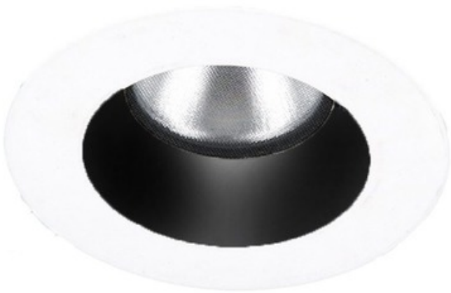
Shown in: White / Black Reflector

Aether 2 Inch Round LED Shallow Housing Downlight Trim was designed to fit in tight plenum spaces with complex HVAC ducts, sprinkler pipes, and conduit runs. Die-cast aluminum trim with extruded aluminum heat sink. Available in Brushed Nickel finish or powder-coated White with a White, Haze, or Black reflector. Dimmable to 0% with 0-10V dimmers (120 & 277V) or to 10% with low-voltage electronic dimmers (120V only). Choice of 85 or 90 CRI; 2700K, 3000K, 3500K, or 4000K color temperature; and 17 degree (spot), 24 degree (narrow flood), 40 degree (flood), or 50 degree (wide flood) beam angle. 35 degree cutoff angle. 2 inch trim aperture and housing height. Accommodates ceiling thickness of 0.5-1 inch. 5 year WAC Lighting warranty. UL listed. Energy Star. Suitable for wet locations. Title 24 Compliant. A complete fixture includes a housing and trim, sold separately. Note: 90CRI option is only available in 2700K and 3000K.