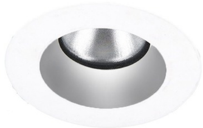
Shown in: White / Haze Reflector

Aether 2 Inch Round LED Shallow Housing Downlight Trim was designed to fit in tight plenum spaces with complex HVAC ducts, sprinkler pipes, and conduit runs. Die-cast aluminum trim with extruded aluminum heat sink. Available in Brushed Nickel finish or powder-coated White with a White, Haze, or Black reflector. Dimmable to 0% with 0-10V dimmers (120 & 277V) or to 10% with low-voltage electronic dimmers (120V only). Choice of 85 or 90 CRI; 2700K, 3000K, 3500K, or 4000K color temperature; and 17 degree (spot), 24 degree (narrow flood), 40 degree (flood), or 50 degree (wide flood) beam angle. 35 degree cutoff angle. 2 inch trim aperture and housing height. Accommodates ceiling thickness of 0.5-1 inch. 5 year WAC Lighting warranty. UL listed. Energy Star. Suitable for wet locations. Title 24 Compliant. A complete fixture includes a housing and trim, sold separately. Note: 90CRI option is only available in 2700K and 3000K.