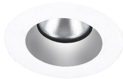
Shown in white / haze reflector

APERTURE SIZE 2.000" APERTURE SHAPE Round FUNCTION Downlight LAMP LIFE 50000 hours BEAM ANGLE 24° COLOR RENDERING 85 CRI LAMP COLOR 2700K LUMENS/WATT 82.00 LUMINOUS FLUX 1230 lumens