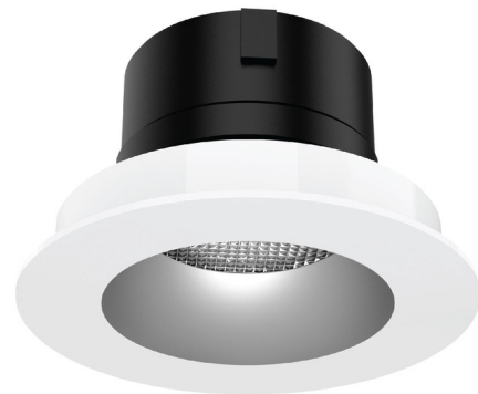
Shown in white / haze reflector