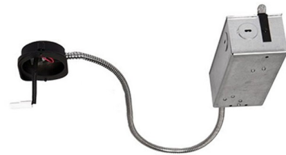
Shown in aluminum