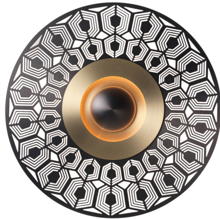
Shown in satin brass / satin graphite