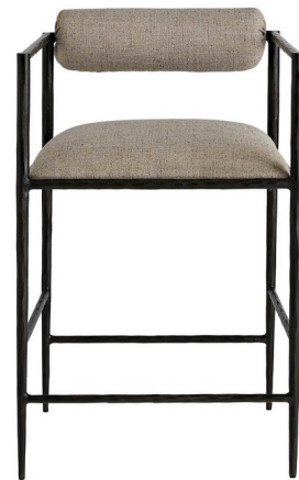
Shown in natural iron / pewter texture

The Barbana Counter Stool is an exquisite piece perfectly poised, perched on delicate legs recalling an insect. A body of natural iron is hand-forged to yield soft impressions along its sharp-angled frame.