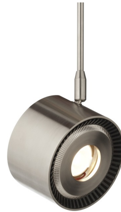
Shown in satin nickel

LAMP LIFE . . . . . 50000 hours BEAM ANGLE . . . . . 20° COLOR RENDERING . . . . . 80 CRI LAMP COLOR . . . . . 3000K LUMENS/WATT . . . . . 44.00 LUMINOUS FLUX . . . . . 704 lumens