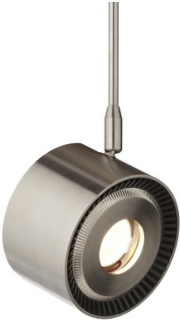
Shown in: Satin Nickel

ISO Freejack Track Fixture is a directional LED head with full 360 degree head rotation and 90 degree pivot. Compatible for use with 1-circuit Monorail track systems or Freejack canopy. Includes 12 volt, 16 watt field replaceable LED module. Features 20, 30 or 50 degree beam spread options and four stem lengths. As a general rule when using the ISO head, it is not recommended using greater than 33 percent of the maximum wattage for the low voltage transformer due to the inrush current requirements. Freejack canopy required if used as a monopoint, sold separately. Dimmer type dependent on system transformer (low voltage magnetic or electronic). Note: Color temperature 2700K is not available with CRI 90.