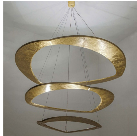
Shown in gold leaf

The Diadema 3 Pendant features three low profile aluminum rings offering indirect illumination. Available with a center feed or offset feed option. 120V direct wire (operates without a driver). Dimmable to 20 percent with a low voltage electronic dimmer, sold separately. Manufactured in Italy by Icone Lighting.