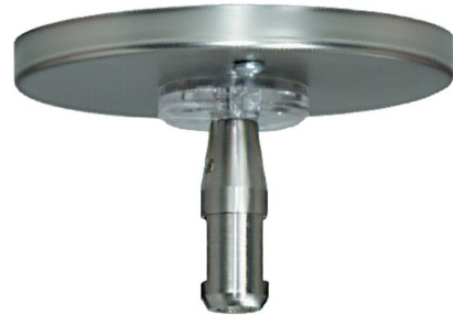
Shown in satin nickel

This single feed flush transformer with electronic transformer converts standard 120 line voltage to 12 volts to provide the necessary voltage for powering a Monorail low voltage lighting system. It can power lamps totaling up to 60 watts. The transformer, concealed by a decorative canopy, fits in junction box and features a fast acting secondary circuit breaker that will safely turn the system off should a short occur. Once the short has been removed the unit can be reset by simply flipping the wall switch off and back on. The shortest rigid standoff that can be used with this surface transformer is the 2 inch rigid standoff, sold separately. If dropping the rail more than 2 inches below the ceiling, order the desired rigid standoff length and one compatible power extender, sold separately.