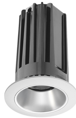
Shown in white / haze