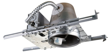
Shown in galvanized steel

R4-GUICAT LED 4 Inch IC AirTight New Construction Housing is designed to be installed in line voltage new construction applications. IC rated housing may have direct contact with insulation. Airtight feature prevents airflow between attic and living areas. Accommodates up to a 12 watt, 120 volt GU10 MR16 LED bulb, sold separately. Low 5.75 inch profile for shallow ceilings. Includes 24 inch adjustable hangar bars. Steel housing adjusts up to 1.75 inch ceiling thickness. ETL listed. Suitable for damp locations. Note: A complete fixture requires a housing and trim, sold separately.