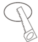
Cut Out: 4 1/4"