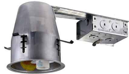
Shown in galvanized steel

R4-GUICRAT 4 Inch Remodel IC Housing is designed to be installed in line voltage applications. Accommodates up to a 10 watt, 120 volt GU10 MR16 LED bulb, sold separately. IC rated housing allows for direct contact with housing. Steel construction housing adjusts up to 1.75 inch ceiling thickness. Ceiling cut out 4.25 inch. ETL listed. Suitable for damp locations. Note: A complete fixture requires a housing and trim, sold separately.