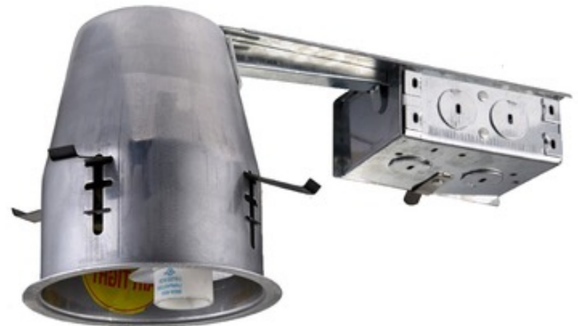
Shown in: Galvanized Steel

R4-GUICRAT 4 Inch Remodel IC Housing is designed to be installed in line voltage applications. Accommodates up to a 10 watt, 120 volt GU10 MR16 LED bulb, sold separately. IC rated housing allows for direct contact with housing. Steel construction housing adjusts up to 1.75 inch ceiling thickness. Ceiling cut out 4.25 inch. ETL listed. Suitable for damp locations. Note: A complete fixture requires a housing and trim, sold separately.