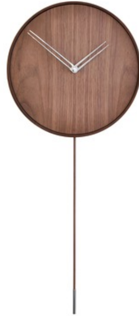
Shown in: Walnut / Polished Steel

The Swing Wall Clock is made of solid walnut with Polished Steel or Polished Brass hands. Requires 1 AA battery.