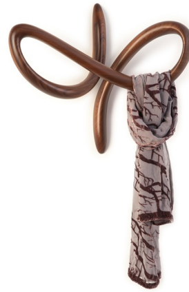
Shown in walnut

The unique and sculptural Vertigo Wall Hanger is polished and hand-crafted from solid walnut. Available in two sizes.