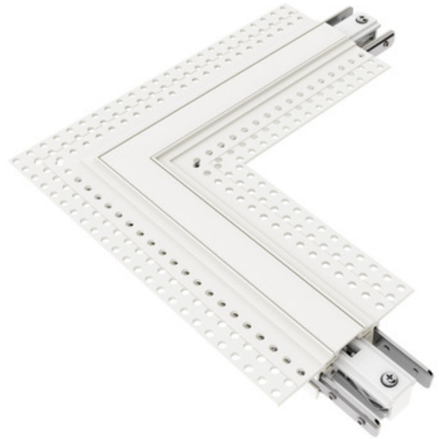
Shown in: White

TruTrack L Connector joins two straight TruTrack Channels together to make a 90 degree angle. Available in a Conductive (LC) or Non-Conductive (LNC) option. Order Non-Conductive when adding two power supplies in a square configuration. Designed for use with PureEdge Lighting TruTrack 1-circuit recessed track.