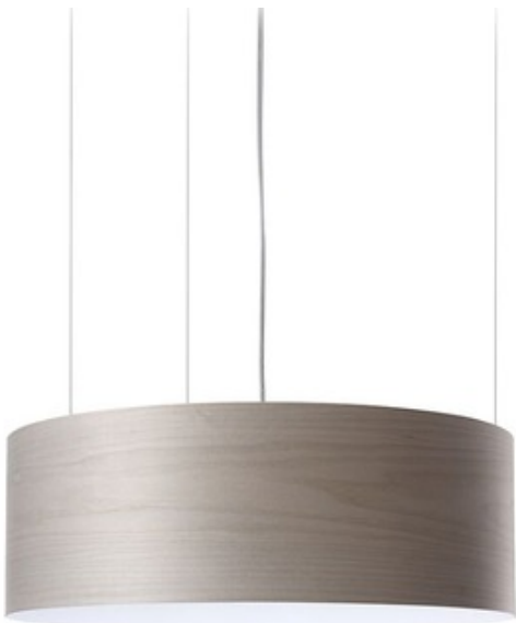
Shown in: Brushed Nickel / Grey Wood

The Gea Club Pendant is characterized by its versatility and simplicity. The light flowing from the side of the lamp creates a warm lighting atmosphere. Supplied with 8 feet of cable to customize the overall height.