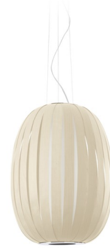
Shown in brushed nickel / ivory white

The Pod Pendant is a vertically elongated and ellipse-like orbit of light whose body is made up of a repeated series of Wood Veneer strips. A small gap between each strip on the Pod allows just a peek at the light within. The Pod is appreciably ostentatious, having a fresh manner that smiles and illuminates its surroundings with an altruistic sense of cool. It is a pendant that works well discretely or as part of a striking cluster. Supplied with 8 feet of cable to customize overall height.