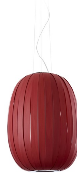
Shown in brushed nickel / red

The Pod Pendant is a vertically elongated and ellipse-like orbit of light whose body is made up of a repeated series of Wood Veneer strips. A small gap between each strip on the Pod allows just a peek at the light within. The Pod is appreciably ostentatious, having a fresh manner that smiles and illuminates its surroundings with an altruistic sense of cool. It is a pendant that works well discretely or as part of a striking cluster. Supplied with 8 feet of cable to customize overall height.