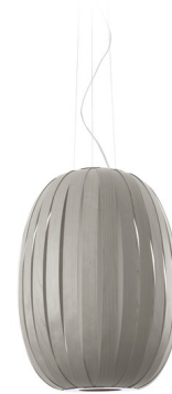
Shown in brushed nickel / grey

PRODUCT DIMENSIONS . . . . . Canopy: 4.7" diameter