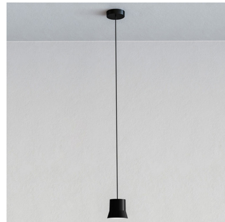
Shown in black / black

PRODUCT DIMENSIONS . . . . . Min / Max Overall Height: 19 11/16" / 59 1/16" COLOR RENDERING . . . . . 80 CRI LAMP COLOR . . . . . 3000K LUMENS/WATT . . . . . 65.00 LUMINOUS FLUX . . . . . 520 lumens