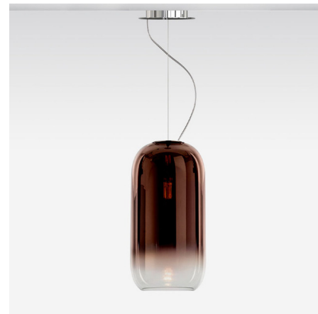
Shown in chrome / copper gradient

COLOR . . . . . Copper Gradient BODY FINISH . . . . . Chrome WATTAGE . . . . . 22W DIMMER . . . . . Standard 120V DIMENSIONS . . . . . 8.25"W x 16.625"H BULB NOT INCLUDED . . . . . 1 x A19/Medium (E26)/22W/120V LED COUNTRY OF ORIGIN . . . . . Italy