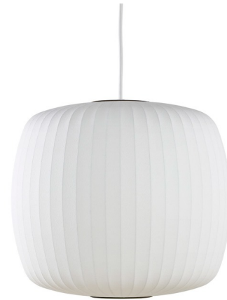
Shown in brushed nickel / white

PRODUCT DIMENSIONS . . . . . Canopy: 5.25" diameter