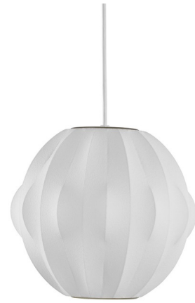
Shown in brushed nickel / white

Nelson Bubble Lamps designed by George Nelson produced by Herman Miller. The Nelson® Orbit™ Bubble Pendant has a striking presence with its recognizable but inimitable shape. This sculptural pendant is available two sizes. Includes Brushed Nickel canopy and an adjustable cord. Inspired by a set of silk-covered Swedish hanging lamps, George Nelson designed the series in 1952, featuring organic, elemental shapes like a rounded apple, an elongated cigar, and a shapely pear. The George Nelson Foundation reintroduced this archival shape in 2018.