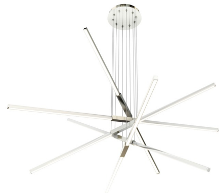
Shown in satin nickel / satin nickel