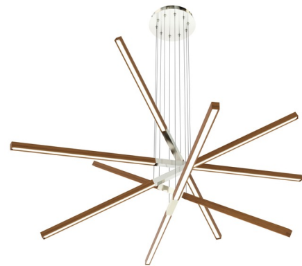
Shown in satin nickel / wood cherry

LAMP LIFE . . . . . 50000 hours COLOR RENDERING . . . . . 92 CRI LAMP COLOR . . . . . 2700K Warm Dim LUMENS/WATT . . . . . 1,080.00 LUMINOUS FLUX . . . . . 5400 lumens