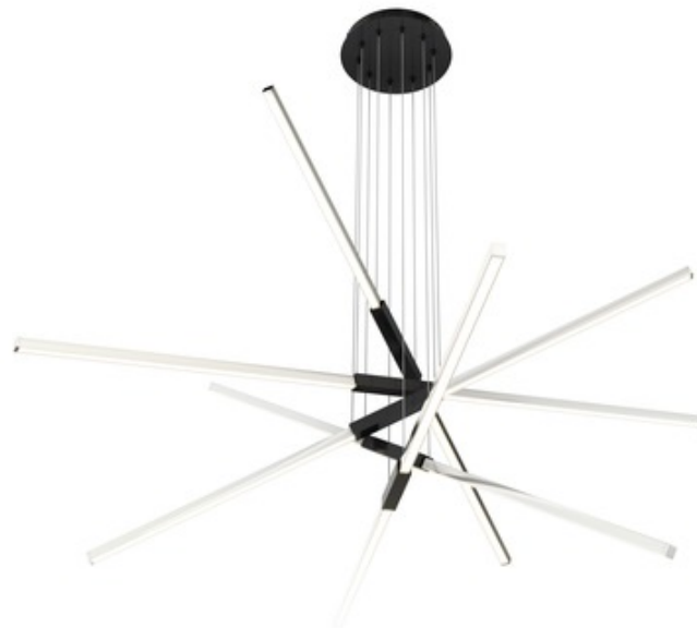
Shown in: Satin Black / Satin Nickel

The Pix Sticks Tie Stix Metal Warm Dim Suspension with Remote Power is the essence of modernity with alluring sleek metal finishes that demand attention. Remote power allows for easier replacement in hard-to-reach spaces such as atriums. Features linear channels that intersect at alternate heights casting downlight illumination through diffused white lenses. Offered in three, five or seven stick channel options from 39-96 inches in length. Includes 5 watts per foot per channel in Warm Dim 2700K-2000K (27D) or 3000K-2000K (30D) color temperature. Unlike standard LEDs, Warm Dim LEDs are designed to shift to a warmer color temperature as they are dimmed, replicating the effects of incandescent and halogen light sources. ETL listed. Title 24 compliant when used with a Universal (UNI) power supply. Product is built to order. .Note: Fixture requires a 24VDC remote Universal (UNI) LED power supply. Supplied with a metal canopy (12 inch for 3 and 5-stick and 16 inch for 7-stick), and 12 feet of suspension cable. Required power supply and compatible dimmer control, sold separately. Note: Channel finishes in Satin Nickel, Satin Black, Chrome, Antique Bronze or White. Satin Nickel and White finishes supplied with matching canopy and hardware. Satin Black, Antique Bronze and Chrome finishes supplied with a Black canopy.