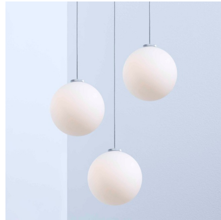
Shown in brushed aluminum / matte opal

The Glass 120 Multi Light Pendant is a simple classic piece, perfect in any room of your home. Acid etched glass globes provide a warm glow across your space and offer adjustable cables to create your own unique piece. Available in 3, 5, 7, 13, 19, 31 and 37 light options with 2700K or 3000K color temperatures. Note: 37 Light option is not available with a Brushed Aluminum finish.