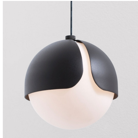
Shown in matte black sandtex / matte opal

LAMP LIFE . . . . . 25000 hours COLOR RENDERING . . . . . 90 CRI LAMP COLOR . . . . . 2700K LUMENS/WATT . . . . . 115.00 LUMINOUS FLUX . . . . . 230 lumens