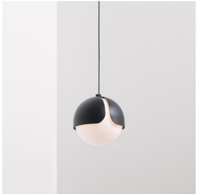
Shown in: Matte Black Sandtex / Matte Opal

The Ohm Pendant is an innovative take on the conventional sphere. The orbiting shade invites curiosity wherever it's placed. The warm matte opal globe is complemented by a Matte Black sandtex, Matte White sandtex, Polished Brass, Polished Chrome, or Polished Copper shade with 2700K or 3000K color temperatures. ETL and cETL listed.