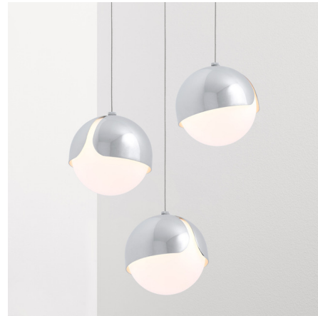
Shown in polished chrome / matte opal

The Ohm Multi Light Pendant is an innovative take on the conventional sphere. The orbiting shades invite curiosity wherever it's placed. The warm Matte Opal globes are complimented by metal shades in 3, 5, and 7 light options with 2700K or 3000K color temperatures. ETL and cETL listed.