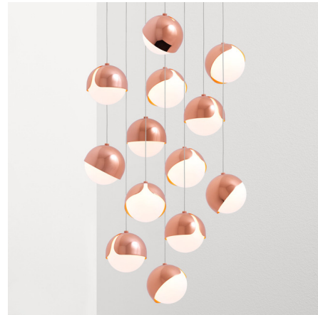
Shown in polished copper / matte opal

The Ohm Round Multi Light Pendant is an innovative take on the conventional sphere. The orbiting shades invite curiosity wherever it's placed. The warm Matte Opal globes are complimented by metal shades in 13 or 19 light options with 2700K or 3000K color temperatures. ETL and cETL listed.