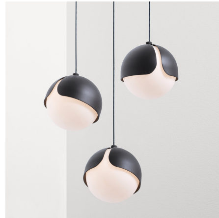
Shown in matte black sandtex / matte opal

The Ohm Multi Light Pendant is an innovative take on the conventional sphere. The orbiting shades invite curiosity wherever it's placed. The warm Matte Opal globes are complimented by metal shades in 3, 5, and 7 light options with 2700K or 3000K color temperatures. ETL and cETL listed.