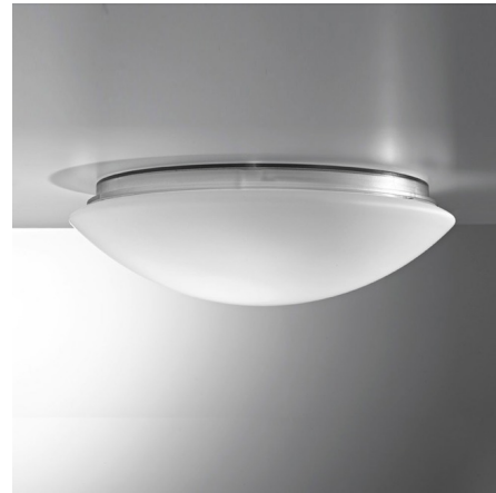
Shown in transparent / opal

The Bis Wall / Ceiling Light is a flush mount fixture that features satin finish triplex Opal blown glass diffusers and translucent polycarbonate bases. The translucent polycarbonate bases create a subtle surface halo. Twist-lock glass allows for easy toolless relamping. Triplex glass, a specialty of Ai Lati, is a three-ply cased Opal glass made up of a thin white layer that is inside two layers of clear glass. This helps optimize the lumen output and creates a uniform light. LED dimmable with LED compatible dimmer. Small size is ADA compliant. Note: Not all options are available.