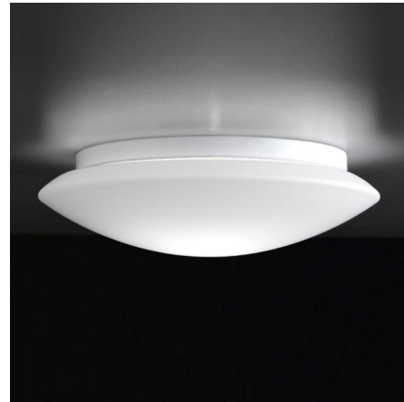
Shown in white / opal

The Bis Bayonet Wall / Ceiling Light has a clean modern shape that provides diffused direct ambient illumination. Features satin triplex Opal blown glass with White painted metal parts. Triplex glass, a specialty of Ai Lati, is a three-ply cased opal glass, made up of a thin white layer that is inside two layers of clear glass. This helps optimize the lumen output and creates a uniform light. Dimmable with Triac dimmer. ADA compliant (except the XLarge size). Made in Italy.