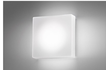
Shown in white / opal

The Caorle Wall / Ceiling Light has a clean modern shape that provides diffused direct ambient illumination. Features satin triplex Opal blown glass with White painted metal parts. Triplex glass, a specialty of Ai Lati, is a three-ply cased opal glass, made up of a thin white layer that is inside two layers of clear glass. This helps optimize the lumen output and creates a uniform light. Available in three sizes and two lamping options. Dimmable with Triac dimmer. ADA compliant. Incandescent is UL listed. Made in Italy.