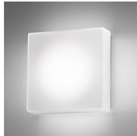
Shown in white / opal

The Caorle Wall / Ceiling Light has a clean modern shape that provides diffused direct ambient illumination. Features satin triplex Opal blown glass with White painted metal parts. Triplex glass, a specialty of Ai Lati, is a three-ply cased opal glass, made up of a thin white layer that is inside two layers of clear glass. This helps optimize the lumen output and creates a uniform light. Available in three sizes and two lamping options. Dimmable with Triac dimmer. ADA compliant. Incandescent is UL listed. Made in Italy.