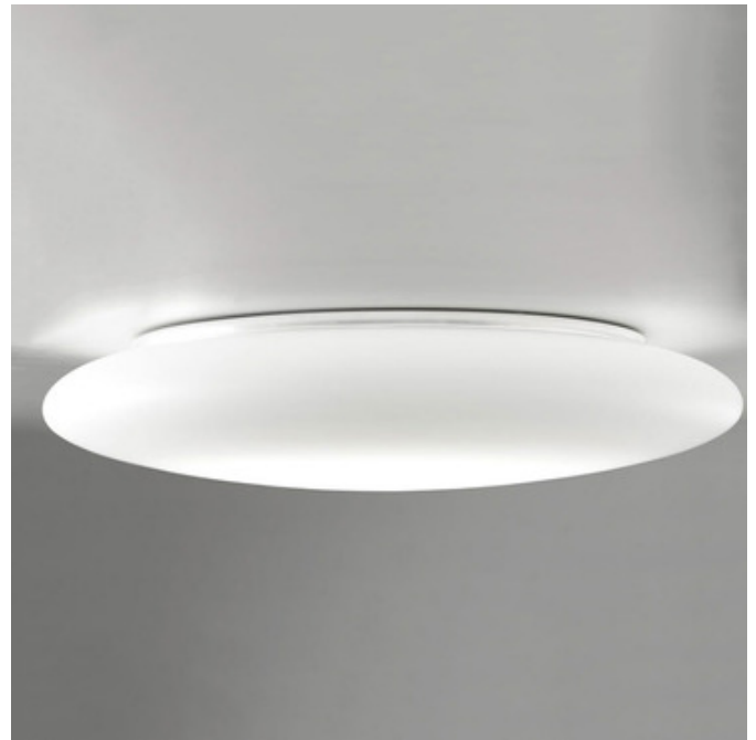
Shown in: White / Opal

The Mentos Wall / Ceiling Light has a clean modern shape that provides diffused direct ambient illumination. Features satin triplex Opal blown glass with White painted metal parts. Triplex glass, a specialty of Ai Lati, is a three-ply cased opal glass, made up of a thin white layer that is inside two layers of clear glass. This helps optimize the lumen output and creates a uniform light. Available in three sizes. Dimmable with Triac dimmer. ADA compliant. UL listed. Made in Italy.