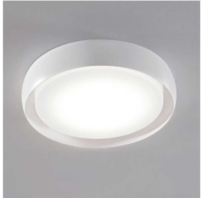
Shown in: White / Opal

The Treviso Wall / Ceiling Light is a contemporary flush mount fixture that can be used on the wall or ceiling. Features a diffuser made of triplex Opal blown glass and painted metal polycarbonate base in White, Black or Gray. Triplex glass, a specialty of Ai Lati, is a three-ply cased Opal glass, made up of a thin white layer that is inside two layers of clear glass. This helps optimize the lumen output and creates a uniform light. Available in 4 sizes and two lamping options. Fluorescent is not dimmable. UL listed. Title 24. Made in Italy.