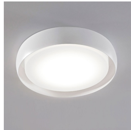
Shown in white / opal

The Treviso Wall / Ceiling Light is a contemporary flush mount fixture that can be used on the wall or ceiling. Features a diffuser made of triplex Opal blown glass and painted metal polycarbonate base in White, Black or Gray. Triplex glass, a specialty of Ai Lati, is a three-ply cased Opal glass, made up of a thin white layer that is inside two layers of clear glass. This helps optimize the lumen output and creates a uniform light. Available in 4 sizes and two lamping options. Fluorescent is not dimmable. UL listed. Title 24. Made in Italy.