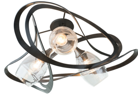
Shown in dark smoke / clear