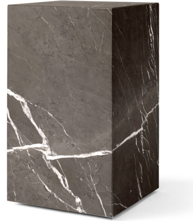
Shown in brown grey

Plinth Tall Marble Table is as versatile as it is timeless. Serves the dual purpose of being a beautiful, sculptural piece on its own and highlighting whatever objects rest upon it. The honed marble carries an air of sophistication and elegance to elevate any space. The heaviness of the Plinth marble stands in contrast to the honed surface; light bounces off of the angles and falls across the tops, producing a spotlight-effect in any space. Though the lines of the podiums are sharp and clean, the naturalness of the marble is at the forefront of its visual identity, creating an intriguing contrast within each piece. Treated with a sealer for surface protection.