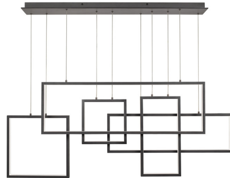
Shown in western bronze / white