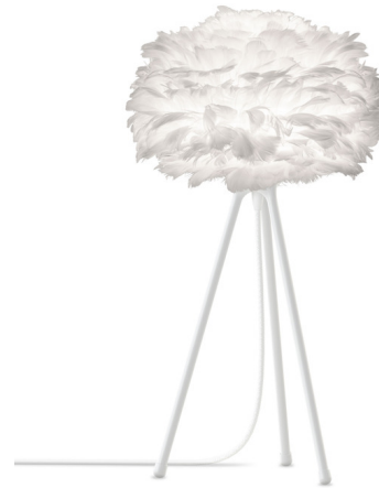
Shown in white / white

The Eos Table Lamp will add a warm and playful accent to your space with its genuine goose down feather shade. Each feather is carefully positioned around a paper core by hand, making each piece unique. The shade sits atop a tripod base with slender legs for a contemporary expression. On/off switch located on cord.