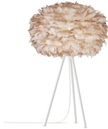
Shown in white / light brown

The Eos Table Lamp will add a warm and playful accent to your space with its genuine goose down feather shade. Each feather is carefully positioned around a paper core by hand, making each piece unique. The shade sits atop a tripod base with slender legs for a contemporary expression. On/off switch located on cord.