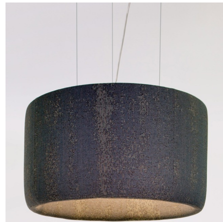
Shown in white / mid grey fabric

With the BuzziJet Pendant, form follows function, offering a simple modern design equipped with acoustic performance. The BuzziJet features a cylindrical silhouette with an upholstered foam core that gives the pendant an airy appearance while allowing sound waves to bounce back-and-forth within the radius of its body to mitigate noise. Available in two sizes with a myriad of fabric options. Includes a White powder coated canopy, mounting plate to cover standard US junction box, and a suspension kit that allows you to suspend the BuzziJet with cables together or apart.