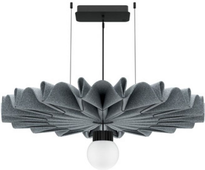
Shown in: Black / Stone Grey Felt / Black Lace

The BuzziPleat Pendant offers a striking dynamic look that combines traditional fashion design techniques with modern acoustic performance. Featuring large architectural folds that mimic smocking, the large-scale design is lightweight and serves to both absorb high and mid tones, as well as diffuse light. At the center the BuzziSol light provides a nice warm glow, complete with a Black powder coated heat sink and canopy and aluminum cables. Available in two sizes with a Ripple or Edel pleat and choice of Stone Grey, Anthracite, Off White or Lime felt with Black lace stitching or an Off White felt shade with White lace stitching.