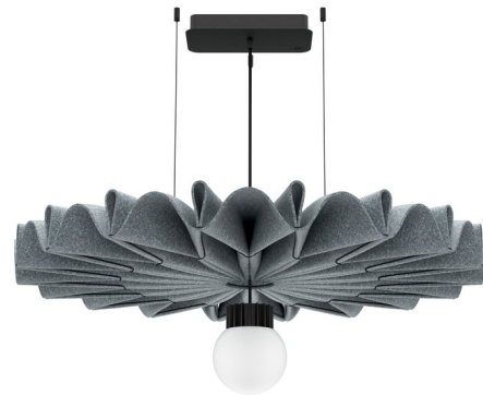
Shown in black / stone grey felt / black lace

COLOR RENDERING . . . . . 90 CRI LAMP COLOR . . . . . 3000K LUMENS/WATT . . . . . 78.95 LUMINOUS FLUX . . . . . 1500 lumens