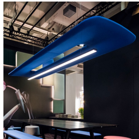
Shown in indigo fabric

COLOR RENDERING . . . . . 90 CRI LAMP COLOR . . . . . 3000K LUMENS/WATT . . . . . 70.77 LUMINOUS FLUX . . . . . 4600 lumens