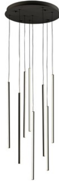
Shown in: Black / Opal

The Chute Multi Light Pendant features extruded aluminum cylinders finished in finely textured powder coat finish of Black or White with rounded Opal silicon diffusers. ETL listed.