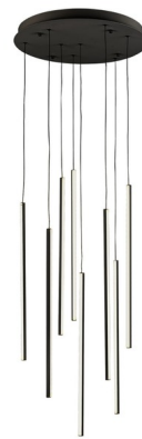
Shown in black / opal