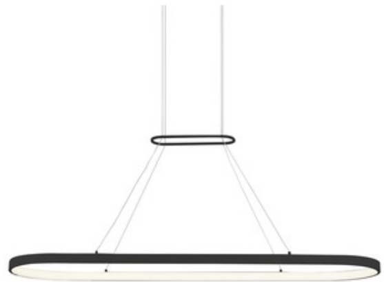
Shown in: Black / Opal

The Erie Linear Pendant is a section of extruded rectangular aluminum rolled into a stadium (oval) shape. Features a flexible silicon Opal diffuser and available in two sizes. Canopy: 12.58 inch length x 5.75 inch width x 1.58 inch height.