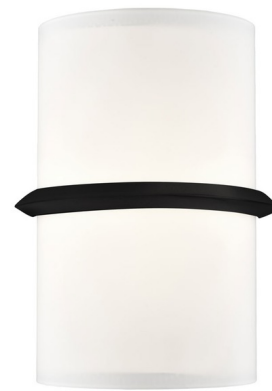
Shown in black / opal

LAMP LIFE . . . . . 50000 hours COLOR RENDERING . . . . . 90 CRI LAMP COLOR . . . . . 3000K LUMENS/WATT . . . . . 48.50 LUMINOUS FLUX . . . . . 679 lumens