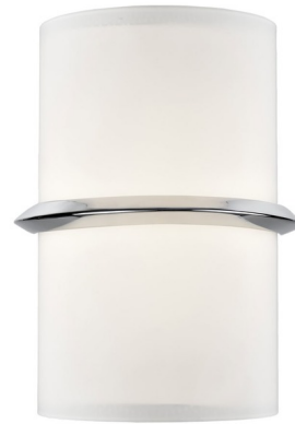
Shown in chrome / opal

The Pondi Wall Sconce features a semi-circular Opal glass diffuser with decorative band in painted Black or plated Brushed Nickel or Brushed Gold.