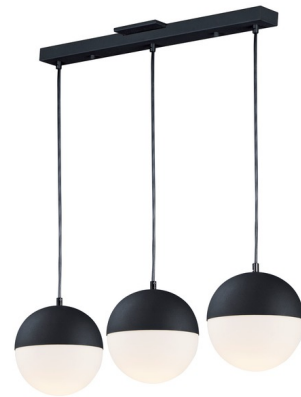
Shown in matte black / satin white

PRODUCT DIMENSIONS . . . . . Min/Max Overall Height: 11.25" – 130.25" LAMP LIFE . . . . . 20000 hours COLOR RENDERING . . . . . 90 CRI LAMP COLOR . . . . . 3000K LUMENS/WATT . . . . . 210.00 LUMINOUS FLUX . . . . . 1890 lumens